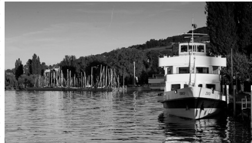
Lake Constance today, in Switzerland

Lots of times, St. Gallus was asked to become a bishop, but he was such a humble man that he always refused. He didn't want to have that kind of power and fame. (Of course, God has helped lots of holy men to be bishops though.) But St. Gallus became well-known whether he liked it or not. Many people knew about this holy man, even though he lived quietly in the forests of Switzerland. And now you know about him too!