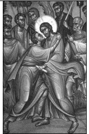
Jesus loved His enemies!

Do you think you can try hard to follow Saint John's advice? Can you learn to love an enemy, somebody who hurts you?