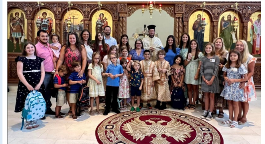
July 30th, Blessing of Students and Educators