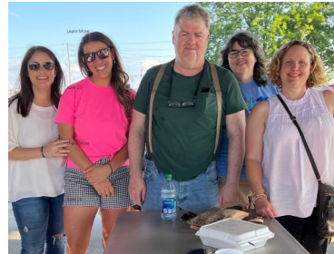
Not-So-Young Adults met up at the City of Centerville Food Truck celebration on June 3rd.