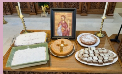
We honored Agios Phanourios on August 27th. Phanouropita is a simple cake that is made and offered on this day.