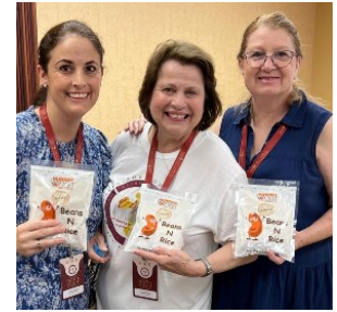
Our Delegates from Clergy Laitly joined Hunger Fight to package 12,000 meals (breakfast, lunch and dinner) for those in need in the Tampa Bay area. They attended workshops and conferences presented by members of the National Philoptochos about the work that we are doing around the world and at home in our local communities.