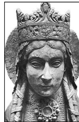
A statue of the saint in France

Saint Chlotilda was queen of France about 1,500 years ago. Her husband was Arian (he didn't believe that Jesus is God), but Chlotilda convinced her husband to believe the truth of the Holy Trinity—Father, Son, and Holy Spirit. They baptized their children in the name of the Holy Trinity. Then, after that, more people in France followed their king's beliefs too.