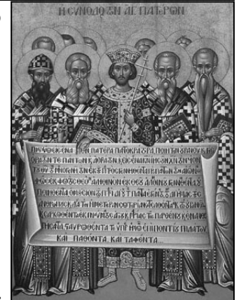
The Holy Fathers

Did you know the priests and bishops of our Orthodox Church meet together sometimes? And your church has a parish council, a group of people who meet together to make decisions for your church. Our church leaders talk about many things so that our Church family can stay close to Christ. In the Gospel today, we hear about how our Lord, Jesus Christ, prayed for His followers. He prayed, "Holy Father, keep them in your name...that they may be one, even as we are one." Let's pray too! We can pray that our Orthodox Church will be one strong Church, close to our Lord!