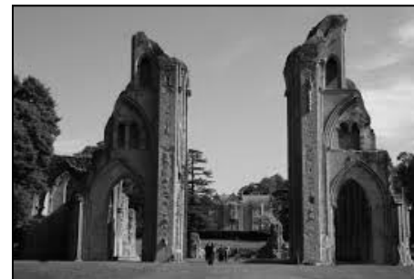
The ruins of an early church in England, near where St. Joseph may have been.

But what happened then? Eventually, Joseph got out of prison and travelled all over, telling people about the good news of Christ's holy resurrection. He was a good person for this job because he knew it firsthand! St. Joseph might have even gone so far as Britain! There, he died peacefully after a long and amazing life!