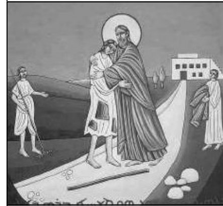
Here comes the jealous brother!

You know the story of the Prodigal Son, don't you? The one son left home and left his father, and he wasted his money. The other one worked hard at home the whole time.